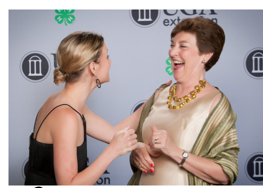
QUOTES FROM THE 2015 GEORGIA 4-H GALA SURVEY