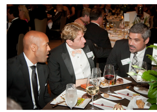
"Pre-function area and table decorations were AWESOME."