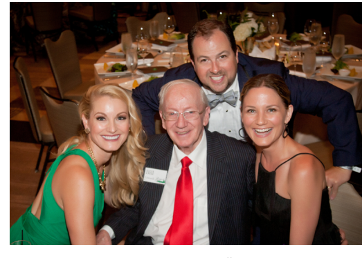
"Superior planning and execution led to a great crowd and atmosphere. The challenge - topping this one in two years."