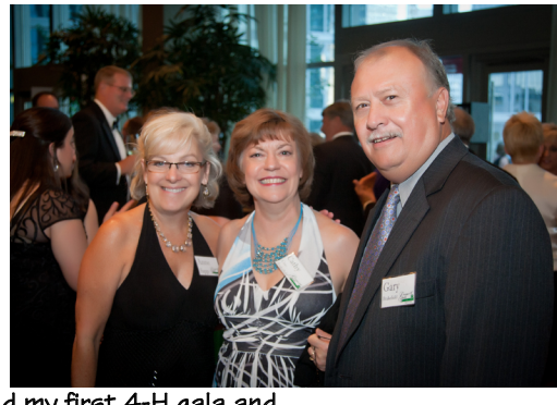
"First rate event! Could not have been more impressed. Was so excited to attend my first 4-H gala and now my only disappointment is that I have to wait two years for the next one."